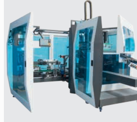
New ergonomic design. All machine parts Double operator position, thanks to rotary are fully accessible by innovative sliding or opening guards. The collation module can easily be separated from the case packer module for change over and.