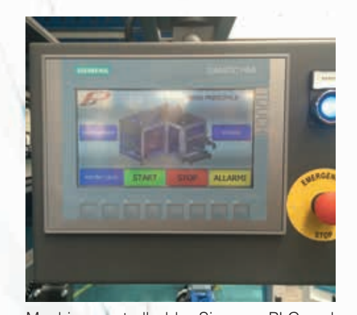
Machine controlled by Siemens PLC and intuitive touch panel. Auto adjustable change of format.