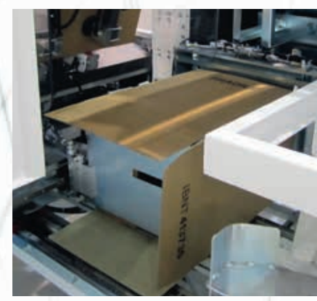
Positive motorized. Automatic cartons In feed conveyor with different loading Blank picking system provided with motor. opening and products insertion.