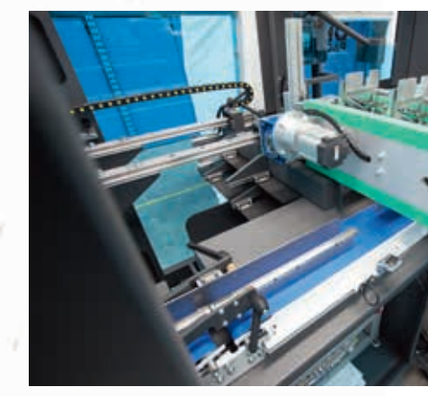
systems depending on the products.