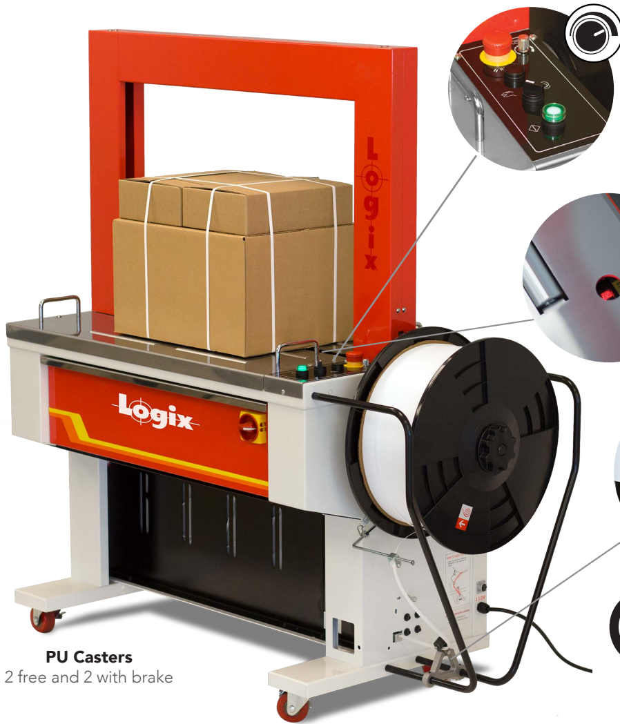
PU Casters 2 free and 2 with brake

The Logix PakStrapper Standard Performance machine features high speed, efficient sealing and accurate tension to deliver professional strapping performance.