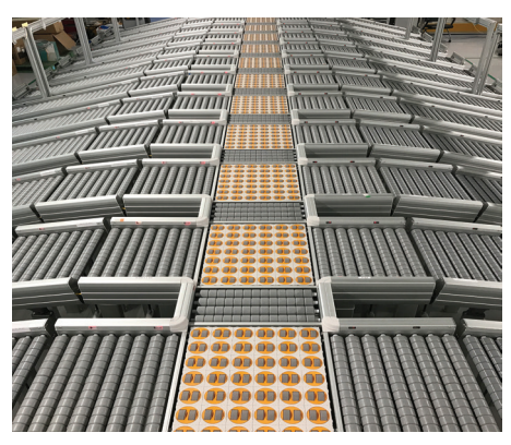
Multiple OTU for 20+ sort stations.