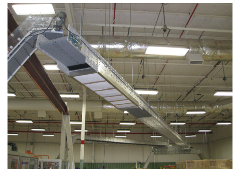
24" width ceiling hung filtered air conveyor system frees up floor space.