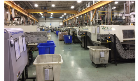
Ergonomic conveyor system that makes more efficient use of labor resources. One attendant for this one very large area.