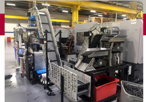
Modular conveyor with parts containment kit, chute & hopper and brushless high efficiency motor.