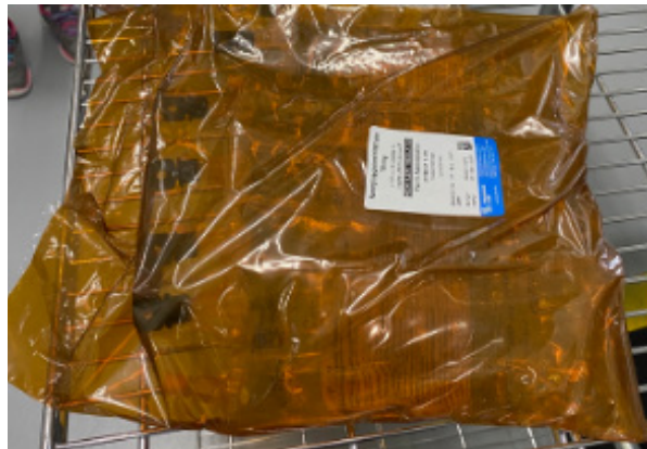
Packaged inside UV bag